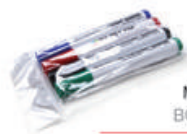
(SETFIXWB) MARKER PENS BOARDMARKER