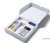
(STARTERKIT) STARTERKIT STARTPACKUNG